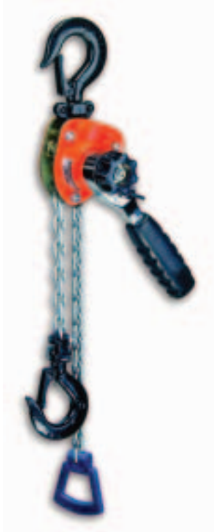
550 LB. Capacity