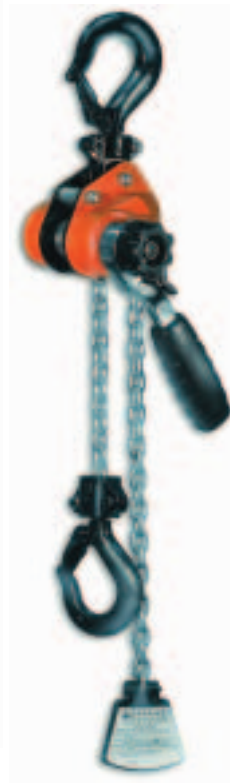
1100 LB. Capacity

Designed for close quarter, standard duty commercial applications. Short handle with low pull requirement makes these units easy to operate.